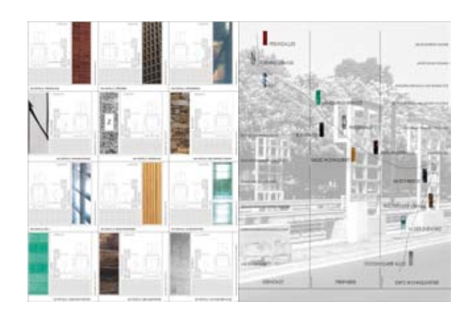
choreography of materiality