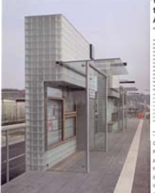
'What the engineer sees as structure, the architect sees as a sculpture. Actually, of course, it is both.'