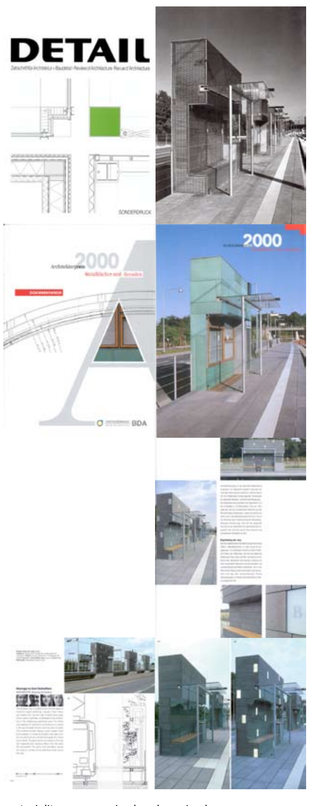
materiality as recognized and received